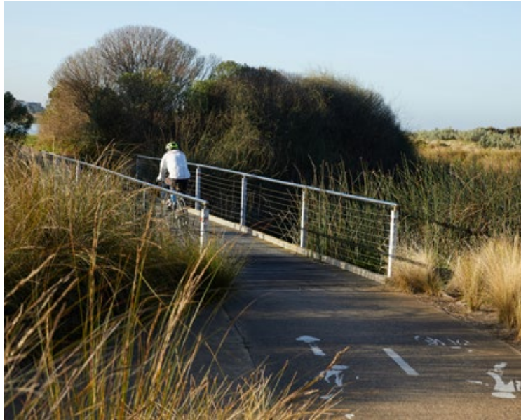
WALK/CYCLE TRAILS The Skeleton Creek bike trail which connects to the Cheetham Wetland and the famous Federation Bike Trail provides 44.2km of accessible, all ability paths for cycling, dog walking, or just an easy stroll.

Boardwalk residents will have easy access to a wide range of experiences and destinations supporting a healthy and active lifestyle.