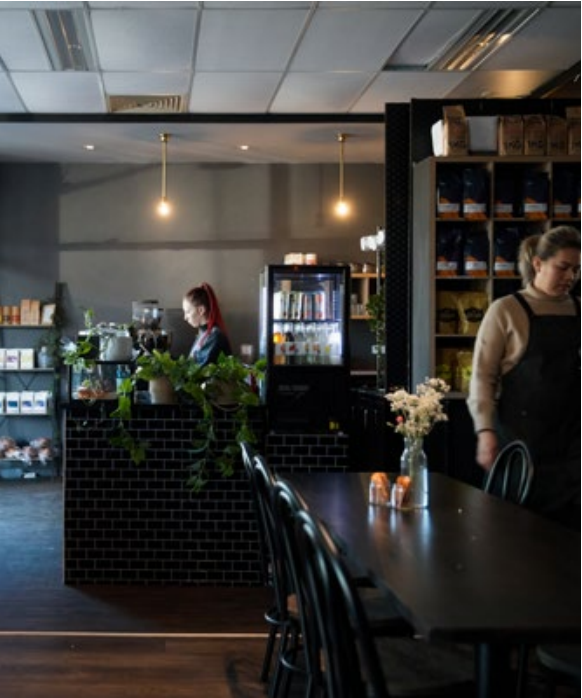
URBAN LIVING In Point Cook's many neighbourhood villages and shopping streets, you'll discover boutique shops, authentic restaurants and great cafes, like Bean Smuggler pictured here.