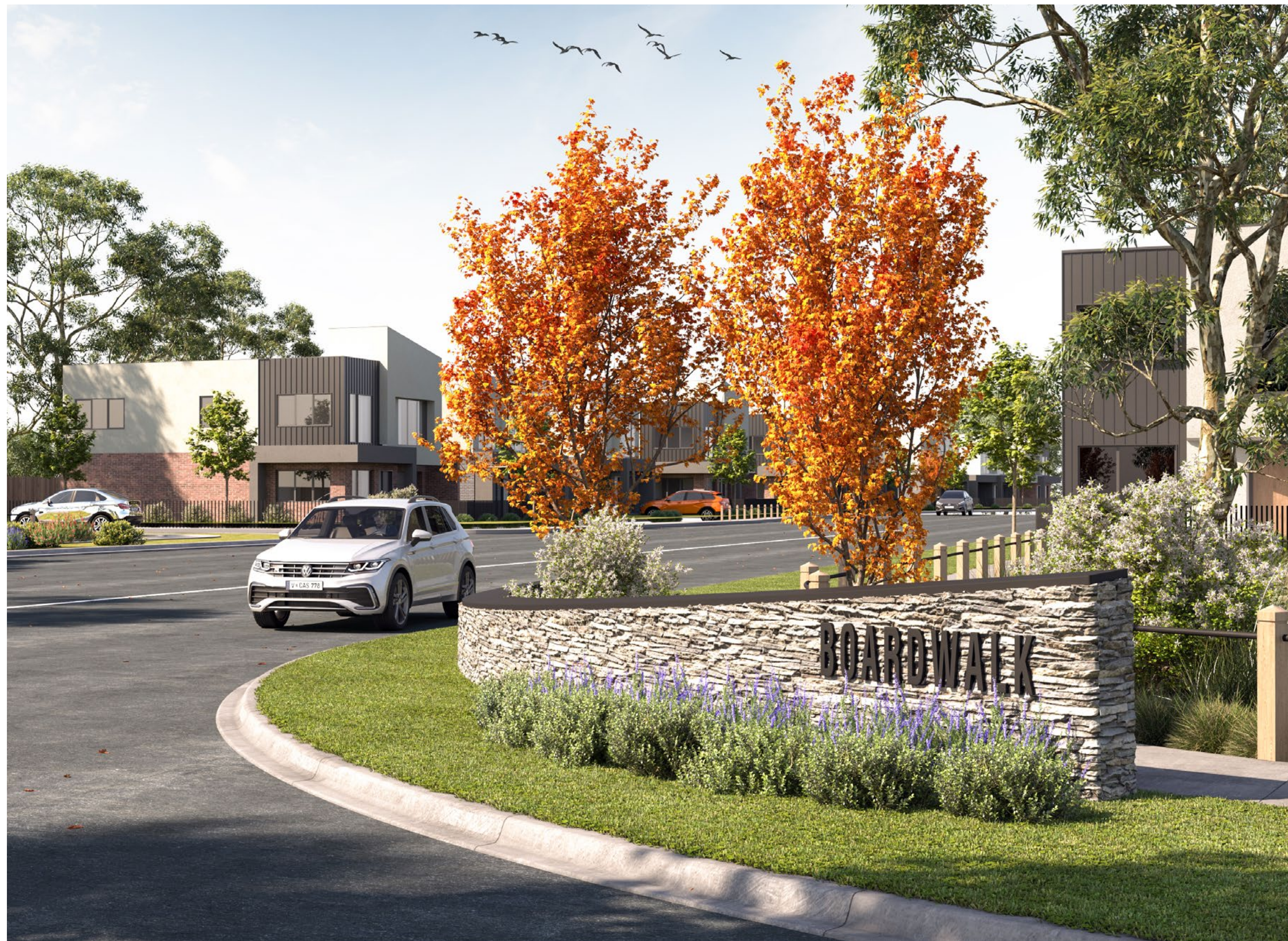
Boardwalk Entry. Artist's Impression.

The upgraded wetlands that run parallel to Boardwalk Boulevard will provide opportunities to live waterside, and a central park will provide the opportunity for many residents to obtain green vistas.