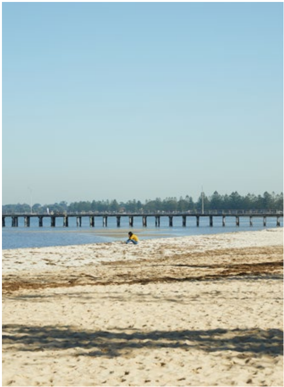
COASTAL ENVIRONS The Western Bayside region is home to protected stretches of coastline and wildlife reserves. Off leash dog beaches, walking tracks and sandy beaches provide Melbournites with an idyllic connection to waterside recreation.