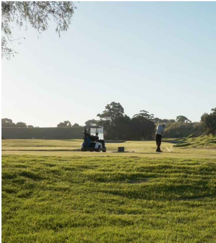
HEALTH AND LEISURE A golfer's, angler's, runner's delight! There are many ways to live a healthy, active, outdoor lifestyle in Point Cook. For those with a love of the greens, the grand Greg Norman designed Sanctuary Lakes Golf Course, set on an old salt mine, is a championship standard members only course, just around the corner.