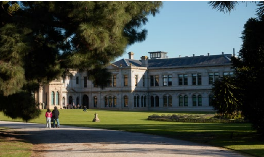
LOCAL HISTORY Explore the grounds of the historic Werribee Mansion, which runs cultural and music festivals throughout the year. Or learn about the area's past, present and future role as a base for the Royal Australian Air Force. Young budding pilots will love the historic plane displays.