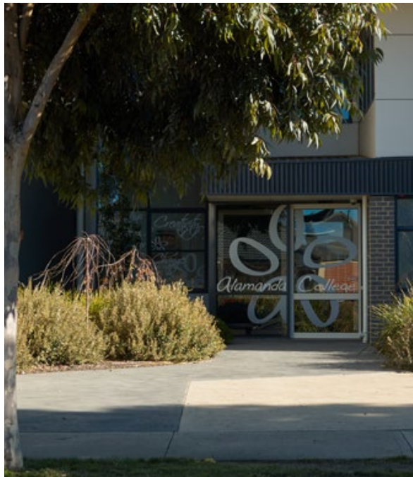
EDUCATION FOR ALL Point Cook has both government and catholic schools that provide comprehensive education for children in early learning through to year 12. There are two schools within a 500m radius of Boardwalk - Featherbrook P-9 College and Alameda P-9 College.