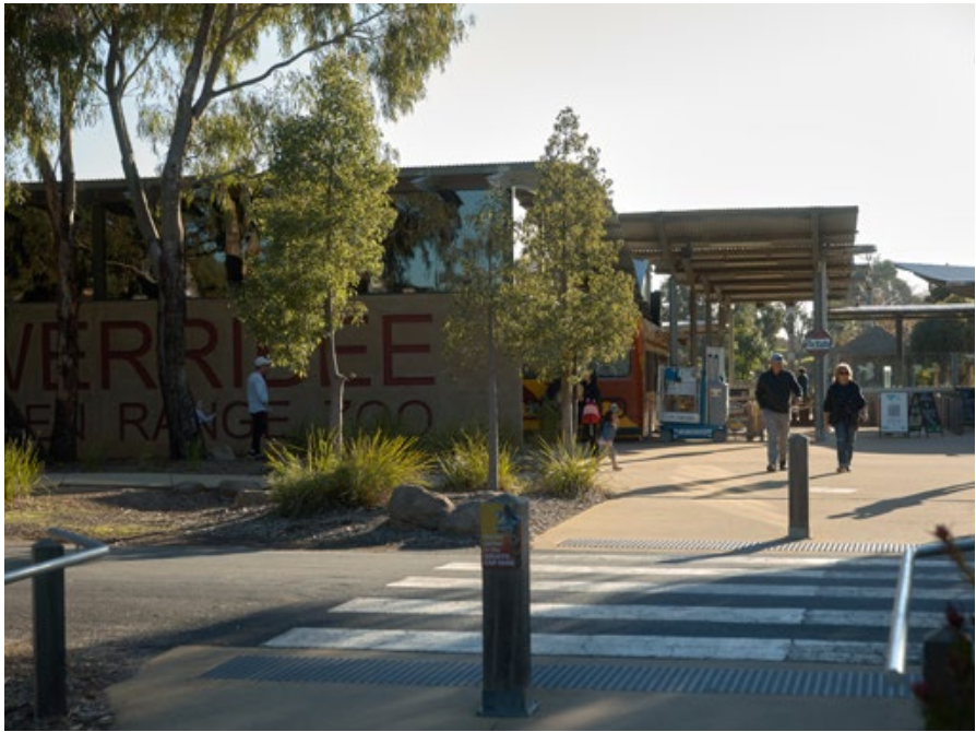
FAMILY ENTERTAINMENT Werribee Open Range Zoo is open every day and kids are free. A handy, fun and educational experience for weekends and school holidays.