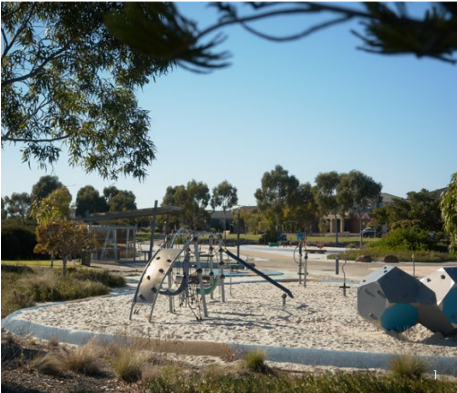
1. Point Cook Playground 2. Local Parkland

Boardwalk residents will also have a brand new 7,500sqm park at the heart of their community, and early purchasers will even be able to have their say in what this park includes.